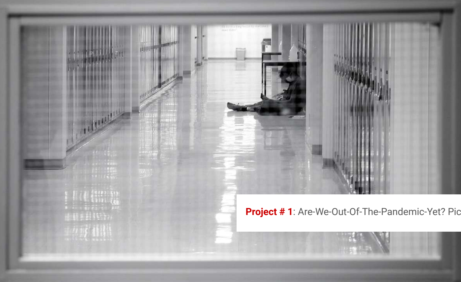
Project # 1: Are-We-Out-Of-The-Pandemic-Yet? Pics