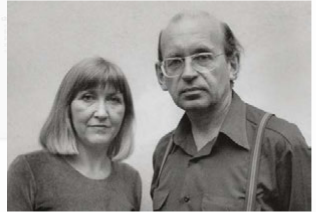
Bernd & Hilla Becher

Hilla Becher and her husband Bernd Becher worked for 40 years photographing industrial architecture that are disappearing throughout Europe and North America. Their work has a documentary style mainly because they shot in black and white. They never shot people. They are considered to be as conceptual photographers because of their unique style. Their work is known for exhibiting several photos of similar structures and being presented in a grid like structure. With their unique style it inspires the work of other conceptual artists. The common themes they use are form and function. The beauty of the relationship between these two elements demonstrates the effect of the industry on the environment and the economy.