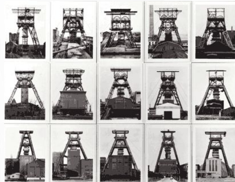
Bernd and Hilla Becher Gas-holders Germany, Belgium, France, Britain, USA, 1966–93

At first glance it may seem a little odd, but when taking a closer look you can see how interesting the series photos are. When I first looked at the series photos I thought that the way they shoot the images, they are very individual and different but at the same time they are similar. Even though they shoot the same structure the structures themselves are different from each other. I like that they used the same elements to create the similarities between the images and the same structure but they also managed to capture the differences in the images to draw the viewer into the photo. The uniqueness of the series isn't the only aspect of their photography that is interesting. The negative space they use in these images helps draw the viewers into the image and enhances the structure they are photographing. Their style allows the viewer to see what Hilla Becher and her husband Bernd Becher were trying to communicate through their photography.